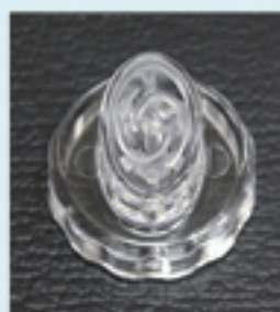
Around the nose

The special tip of the Aqua Sonic consists of two suction holes and one serum discharge hole. Its specially-designed spiral tip is intended to hold a product long enough to soften dead cells of the scalp and skin, provide nutrients, and absorb them in a vacuum state to maximize its peeling and extrusion effects.